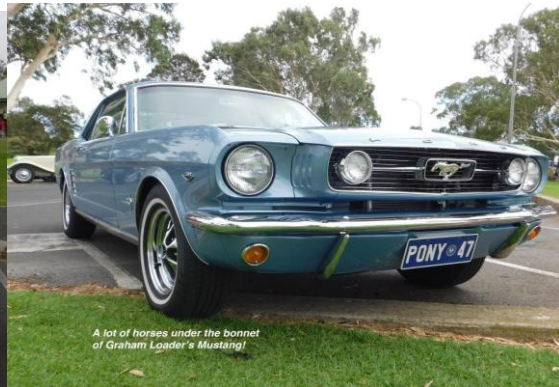
A lot of horses under the bonnet of Graham Loader's Mustang!