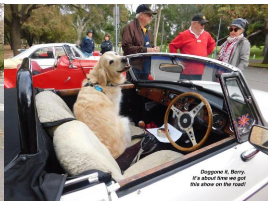
Doggone it, Berry. It's about time we got this show on the road!