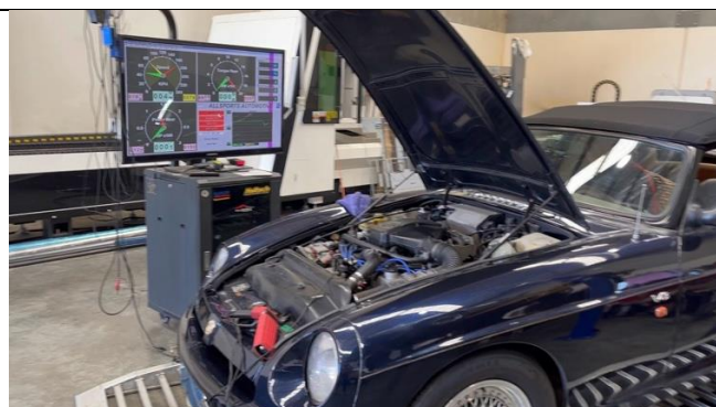
Figure 6 Dyno tuned in Forrestdale to 160 hp