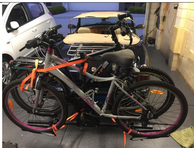
Figure 4 Tow bar for Bike rack [not trailer rated]