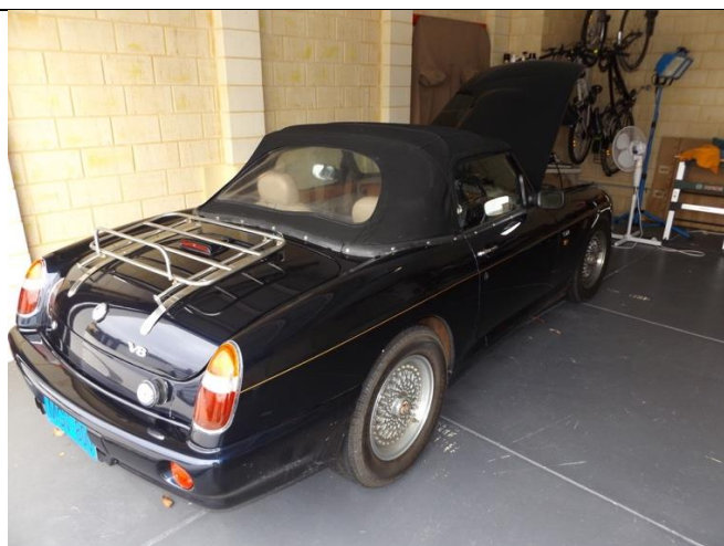
Figure 5 Fabric top new rear window