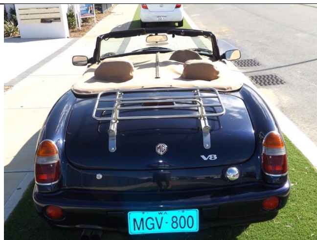
Figure 2 Boot Rack