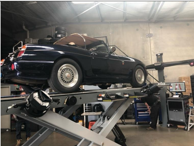
Figure 9 Alignment maintained