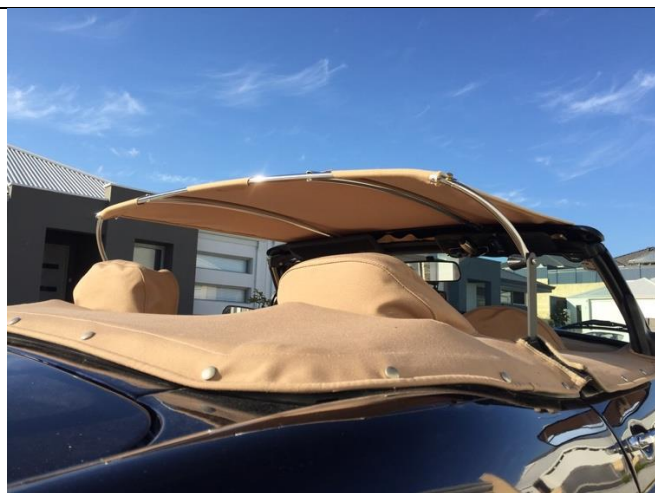
Figure 3 Custom Made Shade/Bimini Top