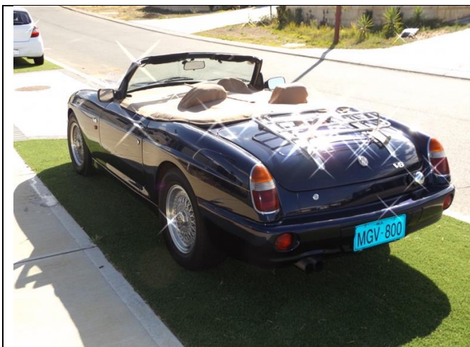
Figure 1 Full Tonneau Cover