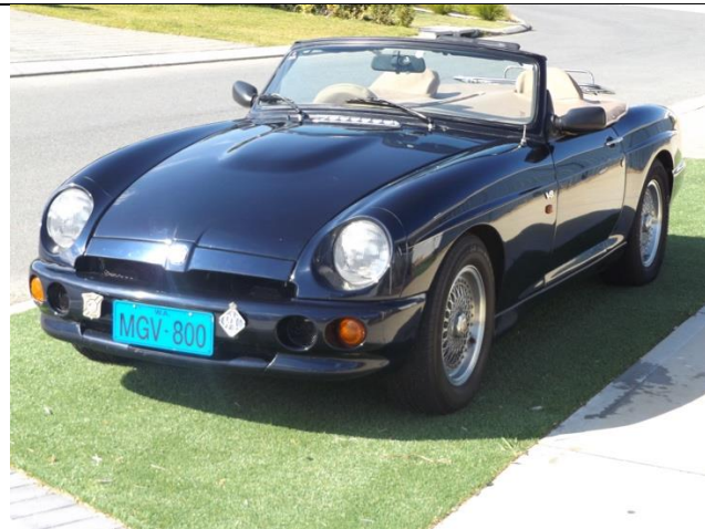
Figure 10 Original Oxford Blue paint